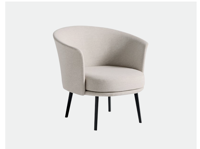
HAY Dorso Swivel Chair