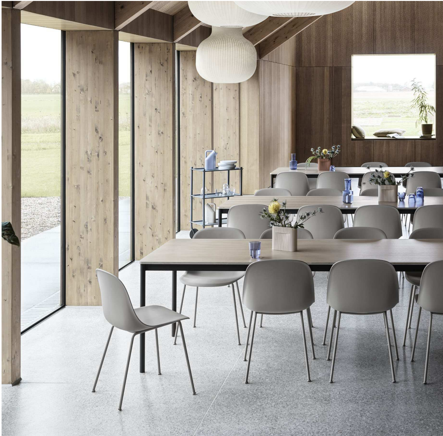
Muuto Fiber Side Chairs