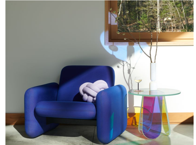
Herman Miller Wilkes Modular Sofa Group