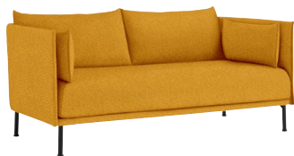
HAY Silhouette Two Seater