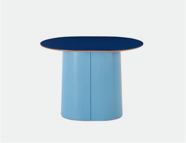
NaughtOne Tun Coffee & Side Table