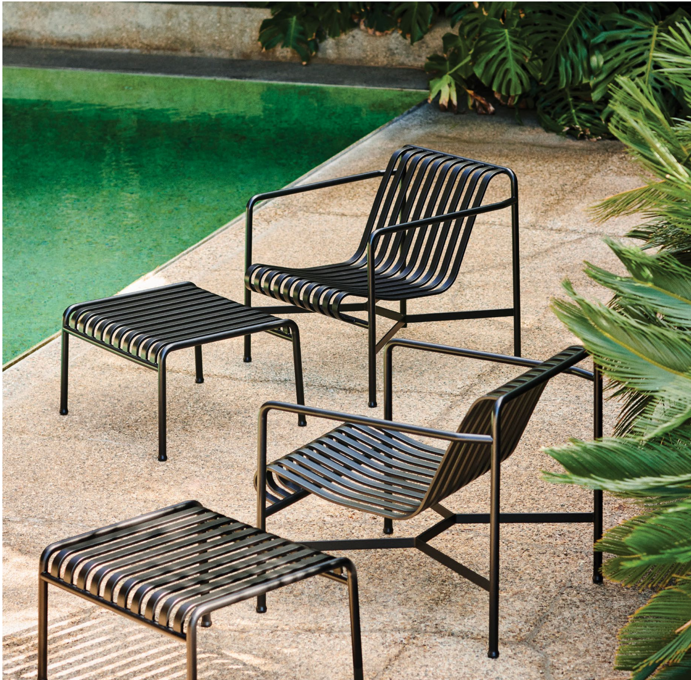
HAY Palissade Lounge Chair