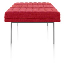
Geiger Tuxedo Museum Bench