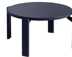
HAY Rey Coffee Table