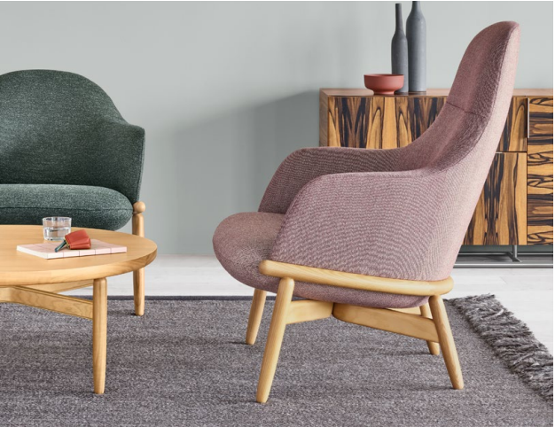
Geiger Reframe High-Back Lounge Chair