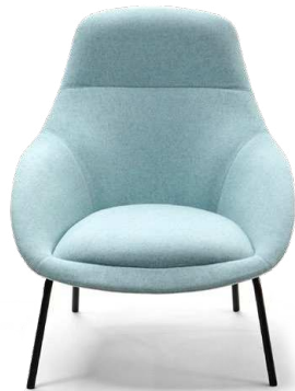
NaughtOne Always Lounge Chair