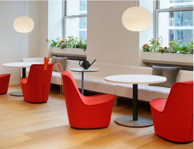
NaughtOne Pippin Lounge Chairs