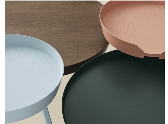
Muuto Around Tables