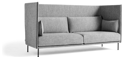
HAY High Back Silhouette Sofa