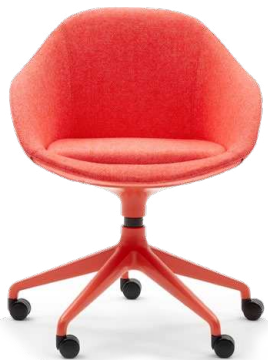
NaughtOne Always Chair

A combination of shapes has created its relaxed form, allowing it to look great from all angles. The Always Lounge is completely customisable offering a wealth of upholstery options, working extremely well in hotels, the workplace, break out zones and public spaces.