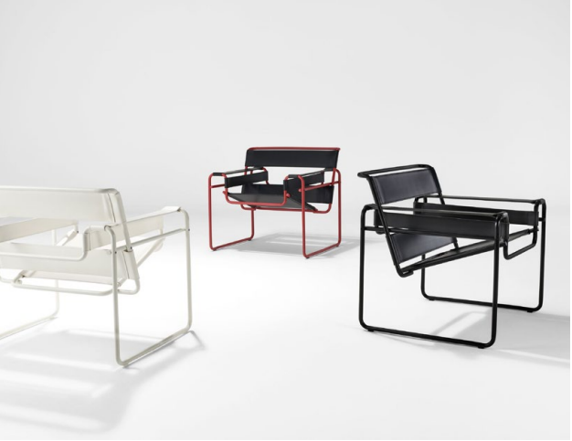
Knoll Wassily Chairs