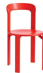
HAY Rey Chair