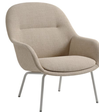
MUUTO Fiber Lounge Armchair