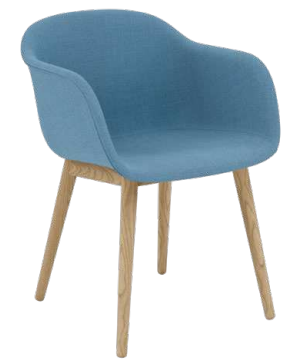
MUUTO Fiber Side Chair