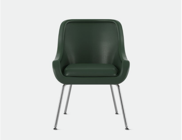
Geiger Bumper Side Chair