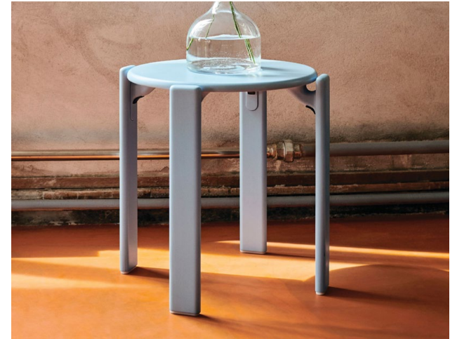
HAY Rey Stool