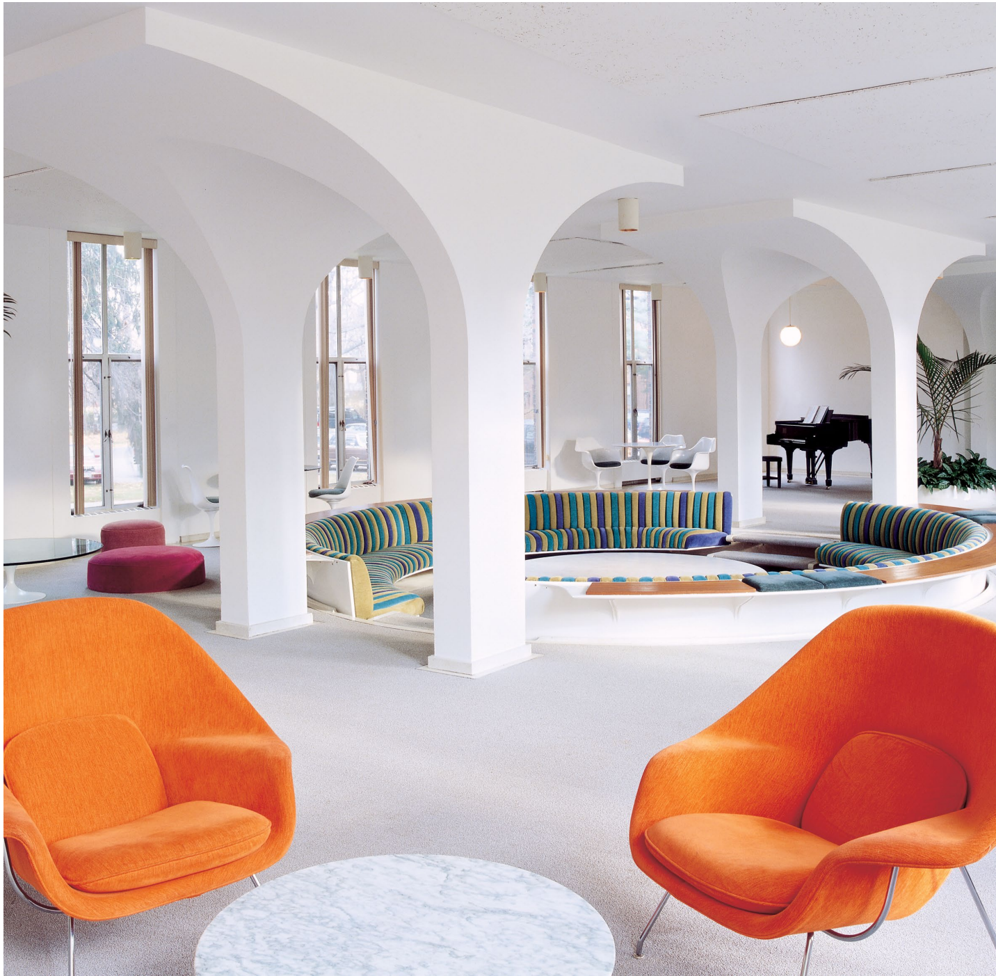
Knoll Womb Chairs