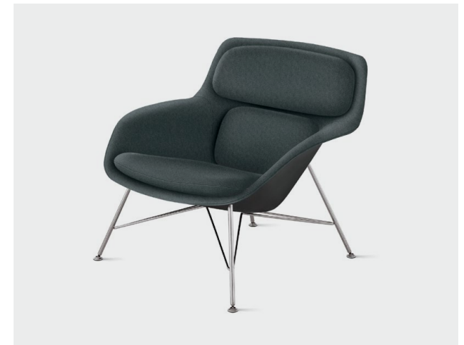
Herman Miller Striad Lounge Chair