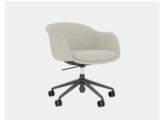
Muuto Fiber Chair