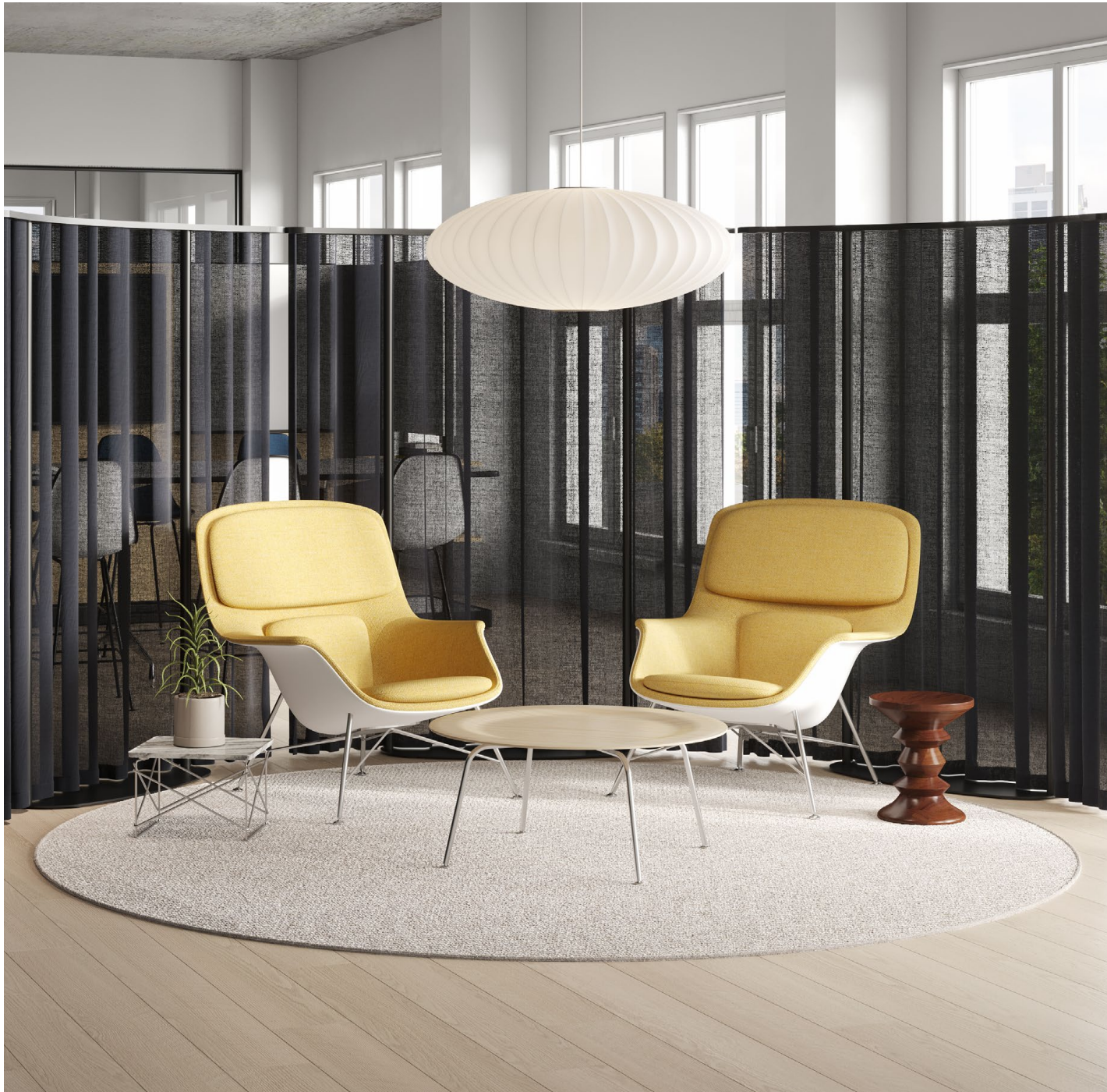
Herman Miller Nelson Bubble Lamp