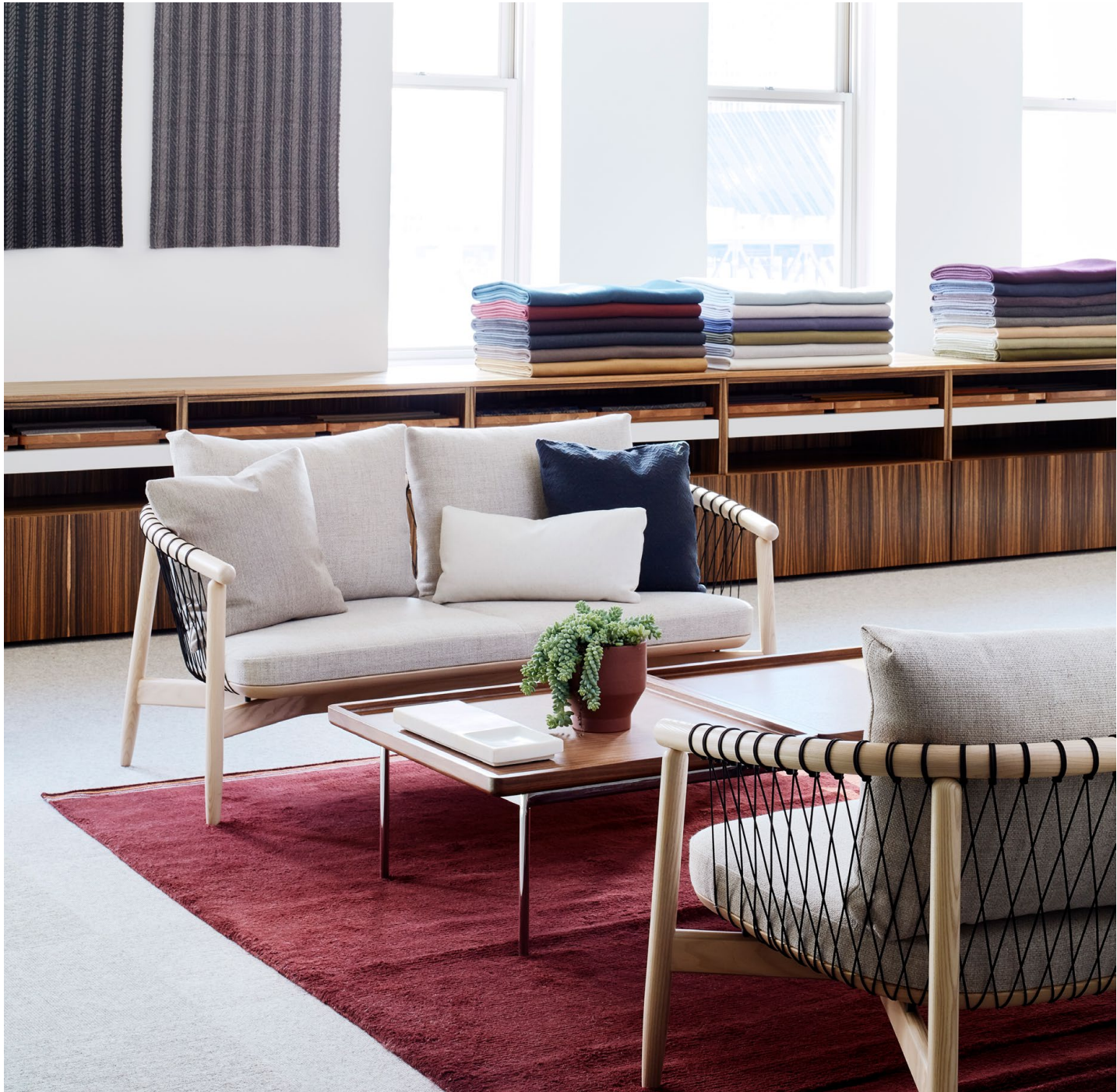
Geiger Crosshatch Collection