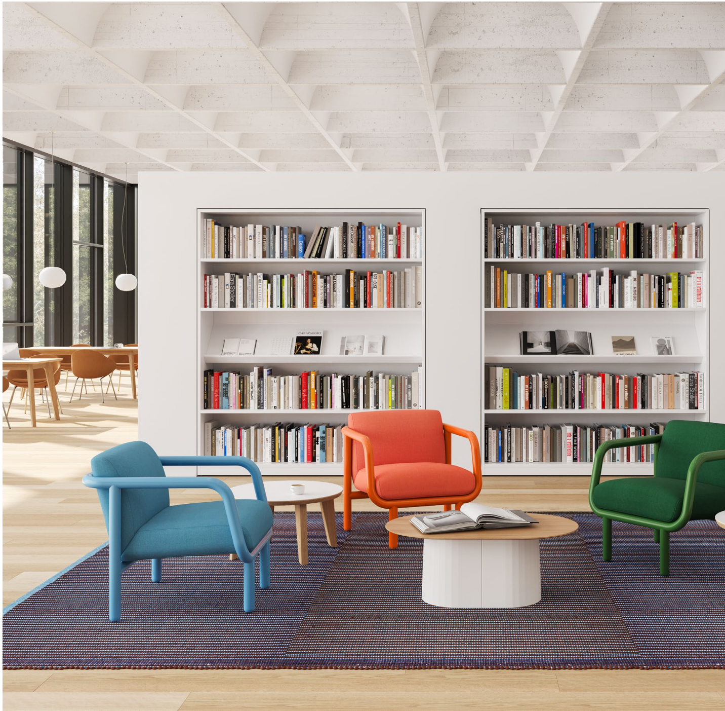
NaughtOne Percy Lounge Chair