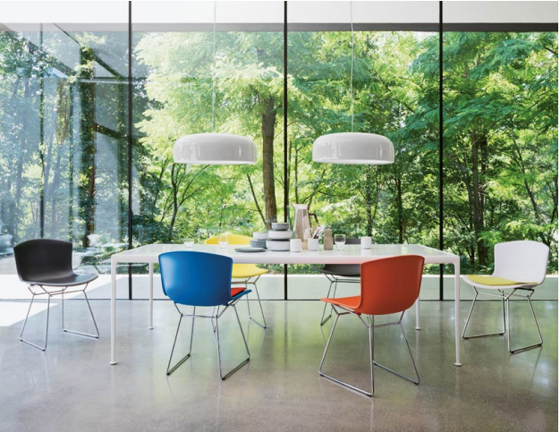
Knoll Bertoia Shell Side Chairs