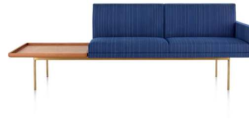
Geiger Tuxedo Component Lounge Seating